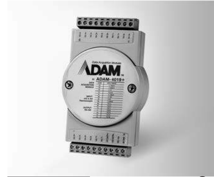
ADAM-4019+ FCC CE RoHS UL