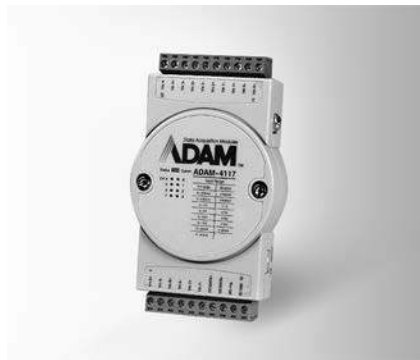
ADAM-4117 FCC CE RoHS UL US