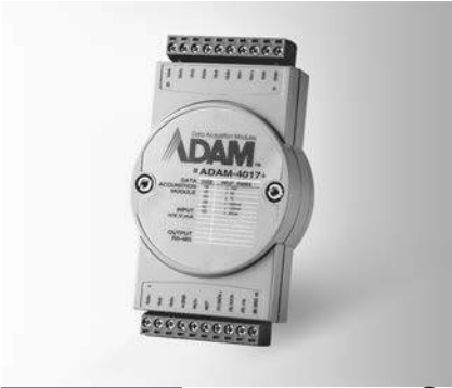
ADAM-4017+ FCC CE RoHS UL

8-ch Analog Input Module with Modbus 8-ch Thermocouple Input Module with Modbus 8-ch Universal Analog Input Module with Modbus