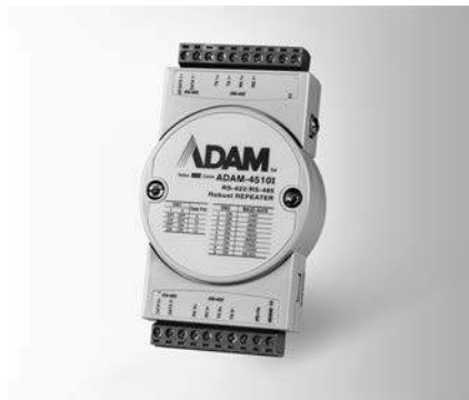
ADAM-4510I FCC CE RoHS UL US

Robust 8-ch Analog Input Module with Modbus