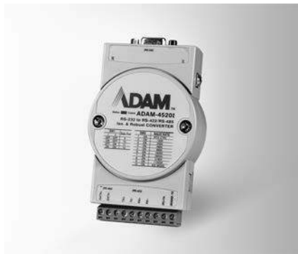
ADAM-4520I FCC CE RoHS UL US