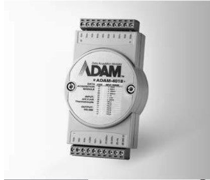
ADAM-4018+ FCC CE RoHS UL